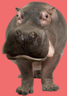
Family activity The Herds 27, 28 & 29 May See website for times

For ages 5-11 - Discover the amazing unseen creatures living in the Museum's pond and look at them under a microscope.