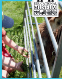
Family event Mill Cottage Farm Thu 29 May 11am-3pm

Help us create a life size baby hippo puppet to raise awareness about climate change. Also have a go at making your own finger puppet.