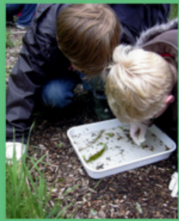
Museum Explorers Pond Dipping Tue 27 May 10.30am-12pm

For ages 5-11 - Discover the amazing unseen creatures living in the Museum's pond and look at them under a microscope.